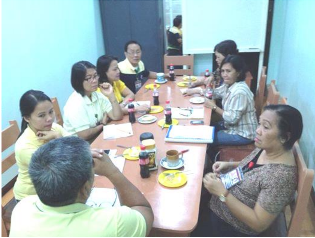
SPMS TECHNICAL COMMITTEE MEETING, AUGUST 17, 2014